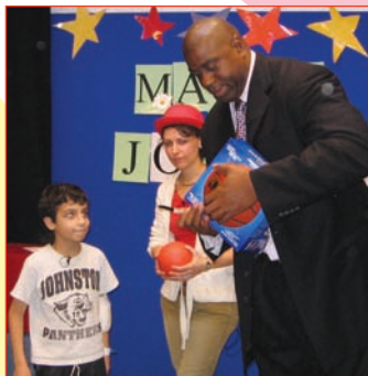
Magic Johnson and a young patient appear on KidZone TV.

Thanks to generous funding from our wish list parties, KidZone TV provides 24/7 programming to the Mount Sinai pediatric population. In our professional-caliber broadcast studio, live shows such as Hospital Bingo, Pictionary, and Hollywood Squares (starring Mount Sinai pediatricians and others) are aired twice daily to patients and families throughout the hospital. To counter the isolation of young patients who may be unable to leave their rooms, viewers are encouraged to call in and hear their voices live on television to win a prize or play a game show with the talent onscreen. Seven days a week patients actively participate in the process of filming a live television show on or off camera. Siblings, friends,