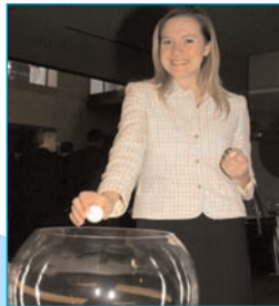
The 2007 Child Life Wish List Party Gallery