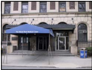
1184 5th Avenue, New York City

The Child Life Program at Mount Sinai offers a full range of activities and services to make the hospital experience easier, more familiar and more comfortable for children.