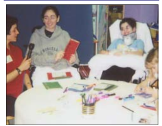
Bookmaking on "Art Party"