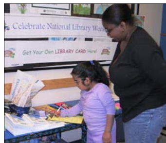
A patient registers for her first library card

room and model reading aloud techniques for parents, doctors provide parents with guidance about literacy development, and children receive a brand new developmentally appropriate book to take home at every check-up. By incorporating books and early literacy