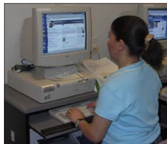
A parent using MedlinePlus

appearance on the web is no guarantee of quality. Here are some criteria searchers can use to judge any health-related site: